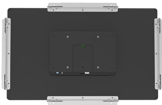
OPTIONAL MOUNT BRACKET

With 10 point multi touch display and I/O's including HDMI, Display Port, VGA and USB, the M24-OF is suitable for many applications and multi roles such as Digital Signage Display / Information Display, Self-Check In and Self-Check Out, or Self Service Terminals (Self Ordering).