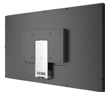
VESA MOUNT 100 X 100MM