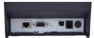
3 in 1 Interface Built In (USB + RS232 + LAN)