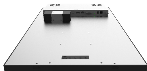
POWER ADAPTOR WITH BRACKET